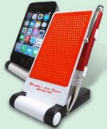
Mini Tool Kits (the size of a pen) for $2.00